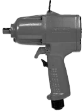
NPW-140 1/2" Sq. Drive Pulse Wrench