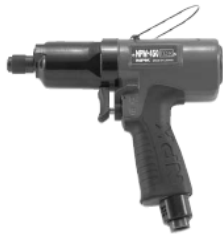
NPW-450A-TDX 1/4" Female Hex Pulse Screwdriver