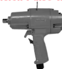
NPW-120T 1/2" Sq. Drive Pulse Wrench