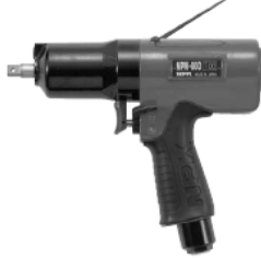
NPW-800B-T00 3/8" Sq. Drive Pulse Wrench