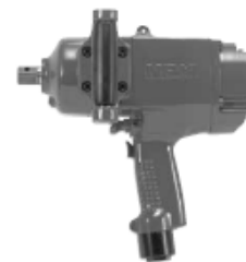
NPW-200T 3/4" Sq. Drive Pulse Wrench