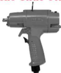
NPW-80T 3/8" Sq. Drive Pulse Wrench