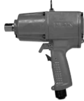
NPW-180 3/4" Sq. Drive Pulse Wrench