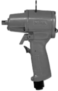
NPW-60 3/8" Sq. Drive Pulse Wrench