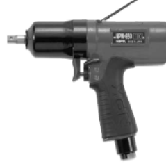
NPW-650A-T00 3/8" Sq. Drive Pulse Wrench