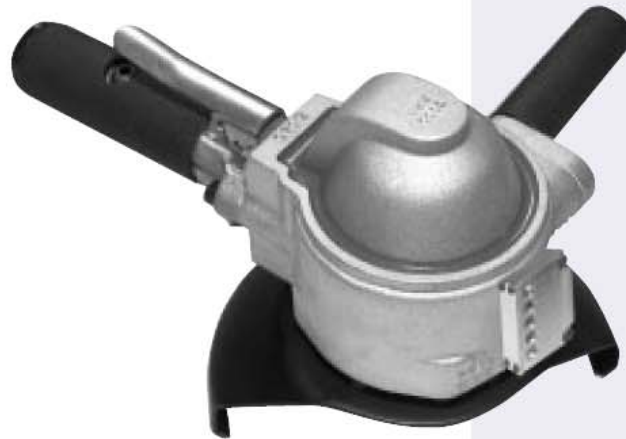
HTVG37-6 w/muffler option installed P/N VGM